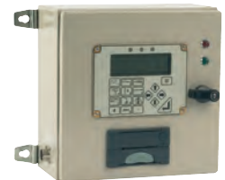
Tool controller in wall box for external control versions. Part No. 60244 without printer or 60254 with printer. Cable for use with PTM tools, Part No. 61127.600.